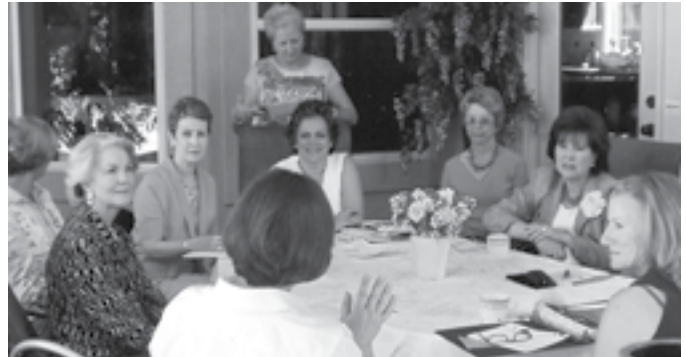
Champion Forest Garden Club board meets before the luncheon to discuss E36 and Champion Forest In Bloom