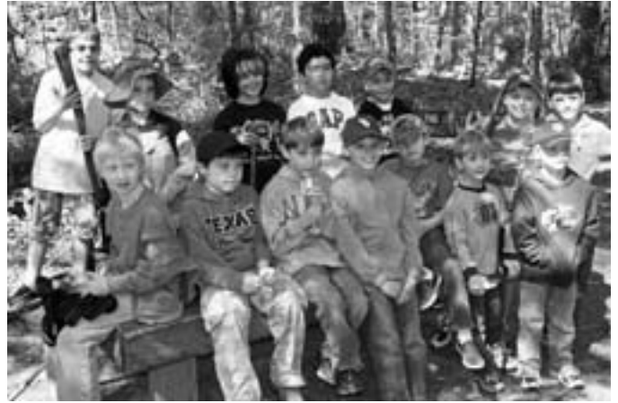
Pack 535 Cub Scouts take a rare (forced) break during Campout Weekend. Gorgeous weather and well-planned activities made for a memorable time for the boys and their parents.

Friday night we had our movie that went off without a hitch and for Saturday's lunch, the group participated in making their own silver turtles. The hike was great. We saw various acts of nature, learned a few things and got in some great exercise too. We also had a lot of bike riders and skateboarding going on! Several scouts earned their fishing belt loop, although no kids came back to tell me about the whopper that got away!