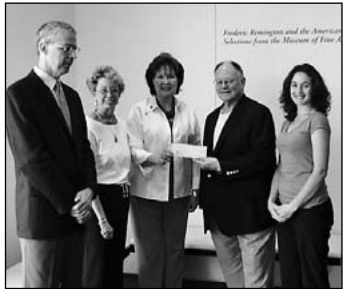
(see page 6)