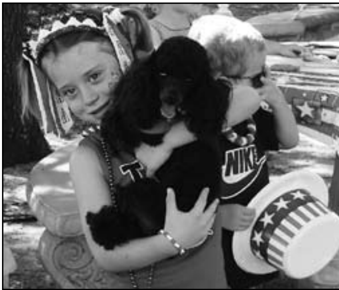
(see page 14)