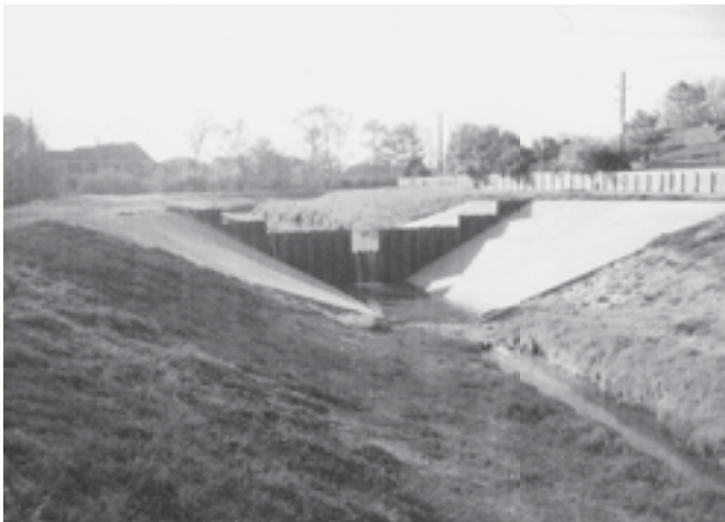
Wildflower Project Progress at Dry Gully