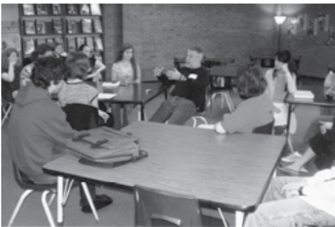
Author Chris Crutcher (center) wows Klein High School "future writers." See page 8 for details.