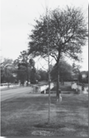
Water oak for Dustin Donica

Last month you read about the Garden Club celebrating Arbor Day by planting a water oak in the esplanade just across from the PUD building. This tree replaces a water oak that wasn't thriving. This tree has been placed there in memory of SPC Dustin R. Donica who was killed on December 28, 2006, while serving in the Army in Iraq and all other soldiers who have lost their lives defending our country.